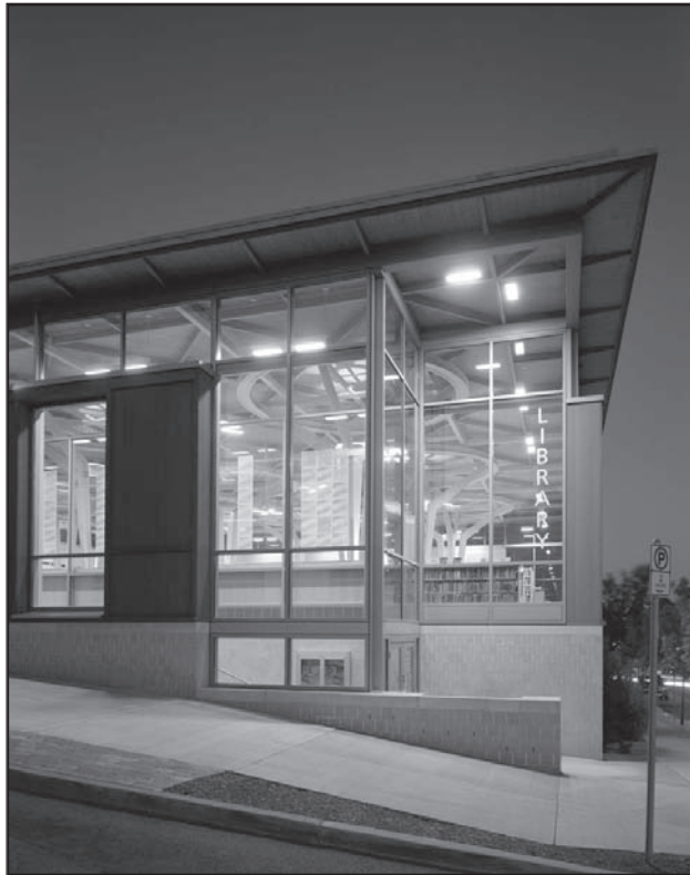
Hillsdale Library (photo by Timothy Hursley, Thomas Hacker Architects).

Bouillon Engineering was retained to evaluate the designed building's compliance to the U.S. Green Building Council's LEED program. It was evaluated in two ways: a baseline model, reflecting the approximate energy cost of a building designed and constructed just to meet code requirements; and a design model, with the model incorporating LEED features reflecting the approximate energy cost of the LEED building. In the engineers' evaluations of the Hillsdale Library design, the baseline model estimated that the building would use 333,302 Kwh/yr, costing $31,049. The design model estimated that the building with LEED features would use 308,309