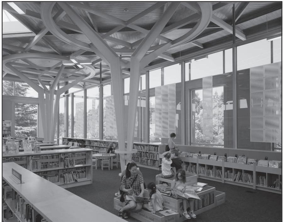
Hillsdale Library.