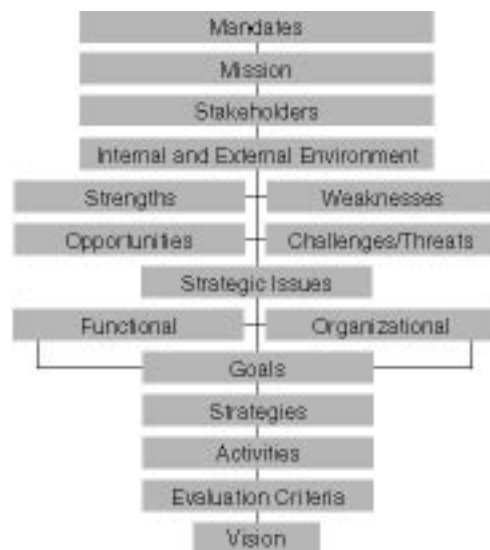
Figure 1: Strategic Planning Elements

The Task Forces met from November 1997 to March 1998 and followed a general outline addressing the elements of a strategic plan. These elements were