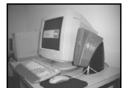
The Windows 2000 thin client.