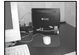
The stylish SunRay thin client from Sun Computers.