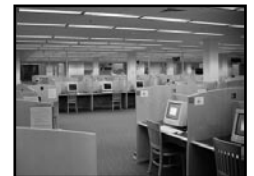
The Information Commons in OSU's Valley Library.

Now that our student staff no longer need to remain at the counter to check out computers, they are more available to assist users with computer questions and to walk around the facility to check that all the machines are working as they should. It should be noted, however, that, unlike a regular student computer lab, it was never intended that complex computer questions would be answered at the assistance desk. Anything questions that go beyond basic assistance with the workstations are handled by telephone by the University's computer assistance desk. The Commons' technical assistance desk and the library reference desk are adjacent to each other and work closely together, complementing each other's services. ☐