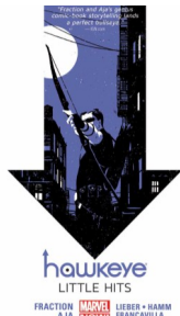
Hawkeye, Volume 2: Little Hits