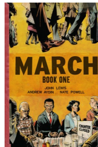
March: Book One