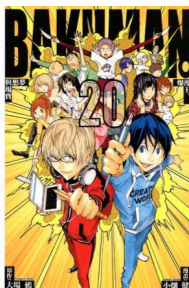
Bakuman, Volume 20