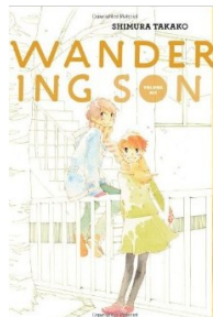
Wandering Son, Volume 6

Lives intersect in the most unexpected ways when teenagers Anne and Lewis cross paths at an estate sale in sleepy Failin, Oregon. Failin's businesses are crumbling, its citizens bitter and disaffected. Anne and Lewis refuse to succumb to the fate of the older generation as they discover the secrets of their hometown and their own families.