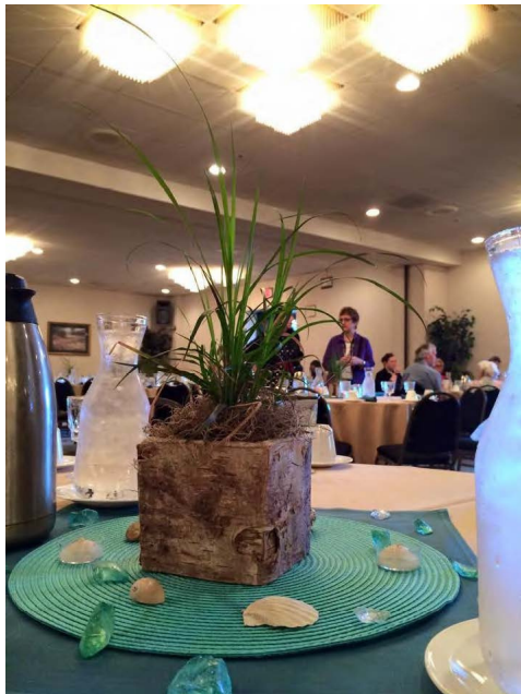
2015 SSD Conference