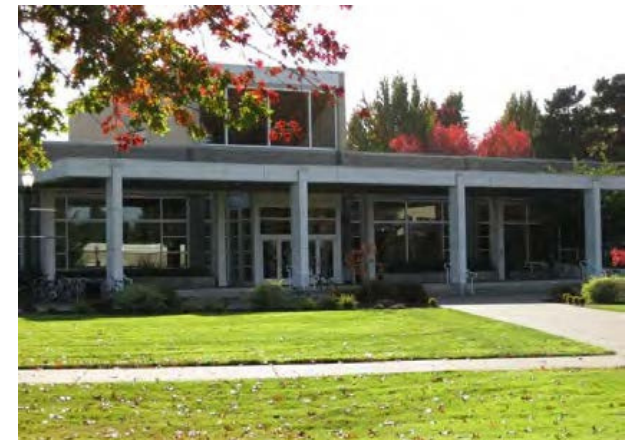
Jereld R. Nicholson Library (Linfield)

Attend a SSD Board meeting! Meetings are open to all members, potential members, and the library community.