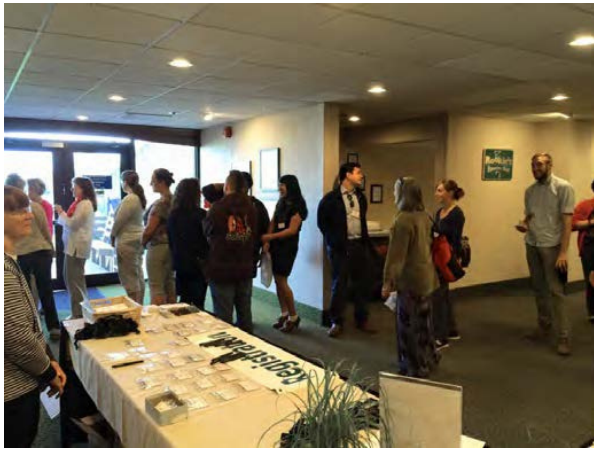
Mingling at a SSD Conference